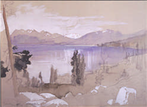
Thomas Moran "Lake Tahoe" Watercolor on paper 11 ¼ x 14 ½ inches