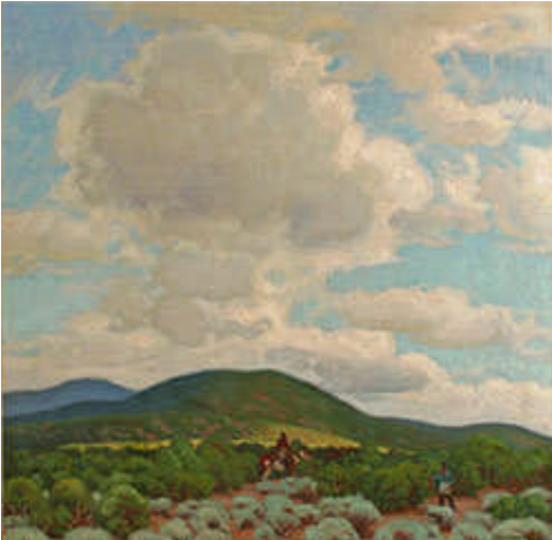
E. Martin Hennings "Rabbit Hunters", ca. 1930 Oil on canvas 30 x 30 inches